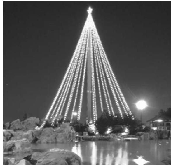
SeaWorld's Tree of Lights is made of 2,168 25-watt light bulbs strung from the tip of the Skytower.

round-trip ride. Before they do any calculations, ask them first to determine what unit of measure they will use in their answer, then to outline their problem-solving logic and methodology. What assumptions will they make to be able to find a solution?